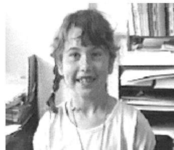
This case is included in the main presentation

Review 5 weeks: Cough gone. Peak flow rates currently normal for age and height. Reducing inhalers with a view to discontinuing them if she remains stable.