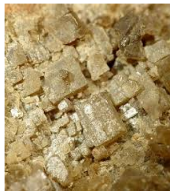
Merc. sol - Mercury (I) Chloride