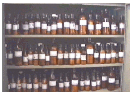
Metal cabinets provide screening

Zacharias CR. Contaminants in commercial homeopathic medicines: a spectroscopic determination . Br Homoeopath J, 1995, Apr;84(2):71-4